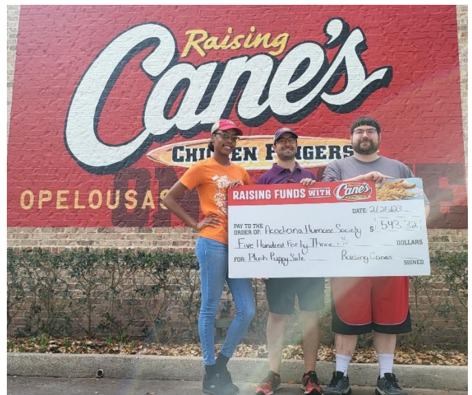
Fundraising Chairman posing with Raising Cane's staff with the big check.

Raising Cane's has again generously chosen to donate their annual Plush Puppy Sale fundraising check to us!